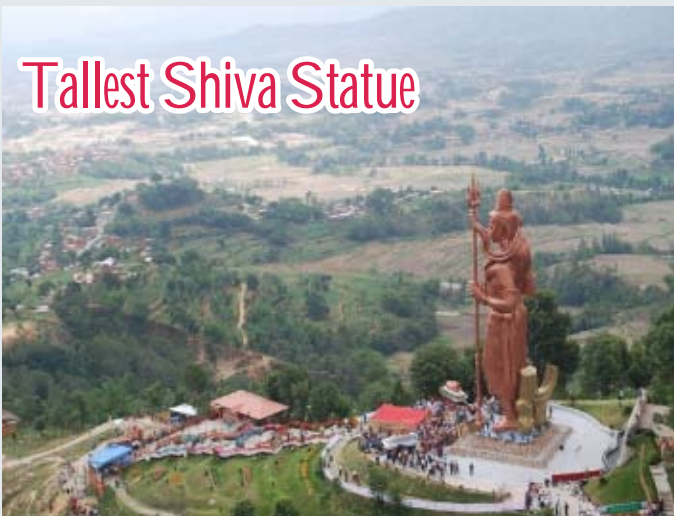
Tallest Shiva Statue